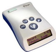
Ohmega - Ambulatory Impedance-pH Recorder